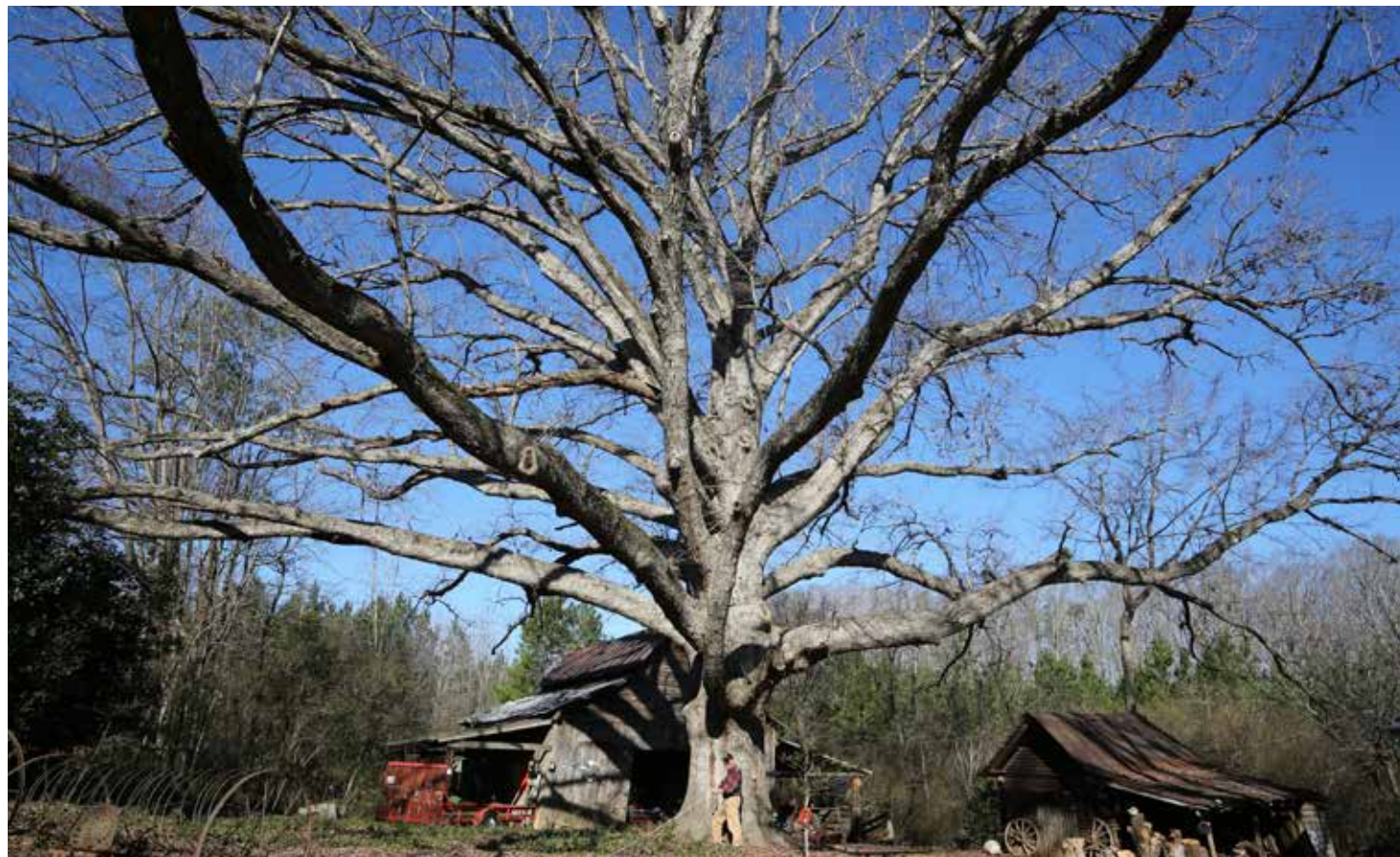
The massive crown of a white oak (below) covers a rural backyard in Montgomery County. Over the past year, the big tree hunters have discovered many champion trees, including a Shumard oak (opposite top) growing in Moore County and a Hercules' club (opposite bottom) in the Outer Banks.

When word reached Carmean and Williamson about the loss of the national champion longleaf, the pair immediately set about trying to locate another large specimen to replace it. Weymouth Woods-Sandhills