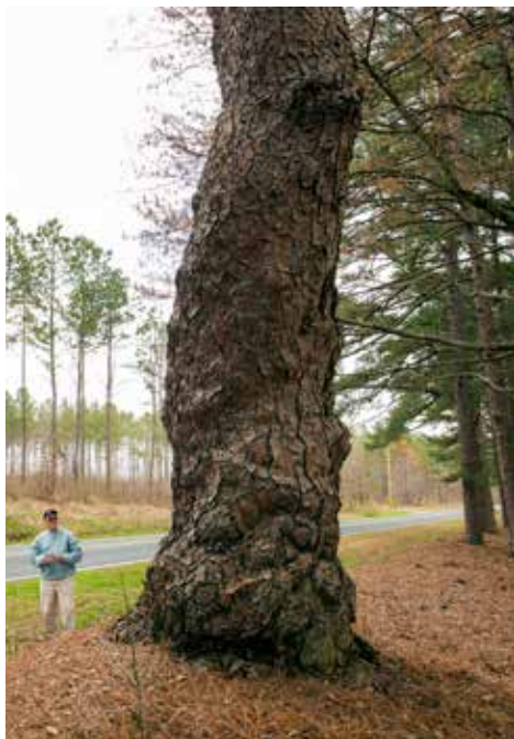
Gary Williamson and Byron Carmean measure the circumference of the new national champion longleaf pine, found just a few miles from the fallen former champion. Its strange, twisted trunk is unlike any other pine the big tree hunters have seen in three decades of searching for champion trees.

Todd Pusser is a marine biologist and a frequent contributor of articles and photographs to Wildlife in North Carolina. To view the current list of state champion trees and to see which native trees are eligible for nomination, or to nominate a tree, visit the North Carolina Forest Service website at www.ncforests-service.gov/Urban/nc_champion_big_trees_overview.htm .